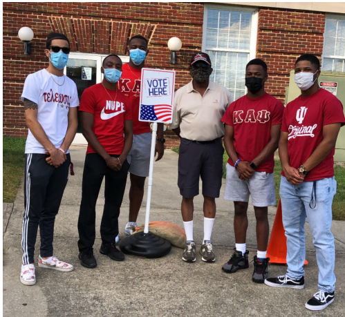
Brothers of the Alpha Nu Chapter at the NC A&T's curbside voting station.