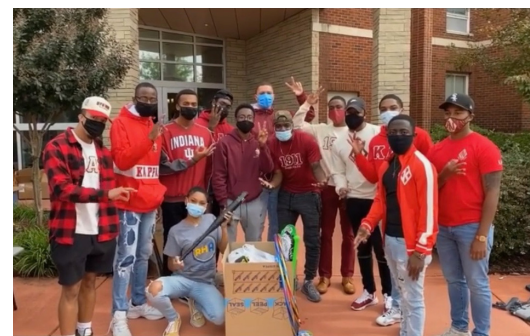
Brothers of Alpha Nu deliver toys collected and donated by members during a toy drive.